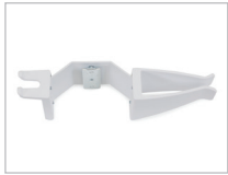
SV POWER CORD HOOK AND SCANNER HOLDER 98-579-062

Durable, easy-to-clean exterior composed of aluminum, high-grade plastic and zinc-plated steel