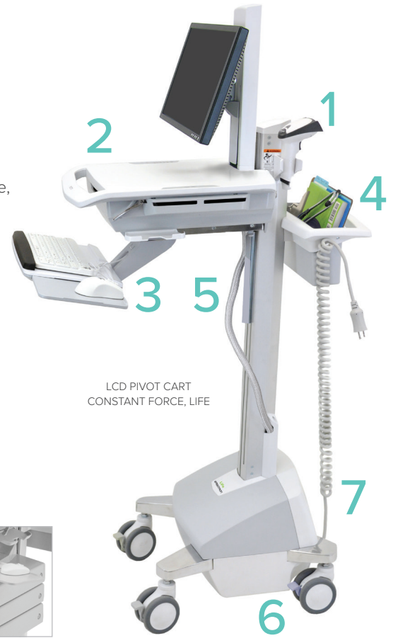
LCD PIVOT CART CONSTANT FORCE, LiFe

Durable, easy-to-clean exterior composed of aluminum, high-grade plastic and zinc-plated steel