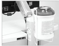
T-SLOT WIPES HOLDER 98-450