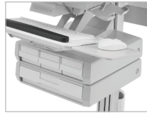
4 DRAWERS (1 PRIMARY TRIPLE AND 1 SUPPLEMENTAL SINGLE)