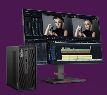
ISV Certifications Certified by leading industry software application vendors for seamless application use