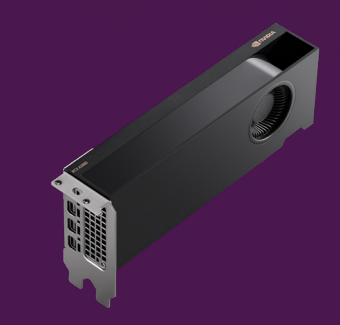
NVIDIA RTX™ A2000 Graphics Card

For a full list of accessories and options, please visit: accsmartfind.lenovo.com